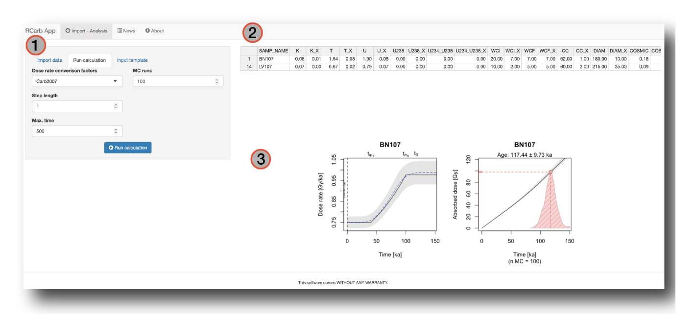
Figure 3: Screenshot of the Shiny app 'RCarb App' providing a graphical user interface to the package 'RCarb'. (1) Data import and calculation menu, (2) central data table with input and output data and (3) graphical output similar to Fig. 2.

of Table 1 in Mauz & Hoffmann (2014) for different waterand carbonate-mass fractions for a grain size of 250 \mu m (Tables A1–A2) and 4 \mu m (Tables A3–A4). Values for the Useries and the Th-series are quoted for each grain size, and the lower rows of each table list the corresponding 2\sigma uncertainties.